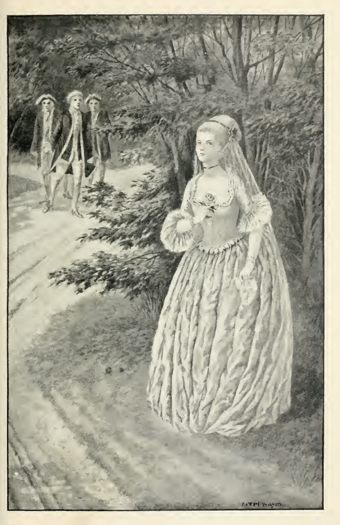
In the shadow of a hornbeam hedge