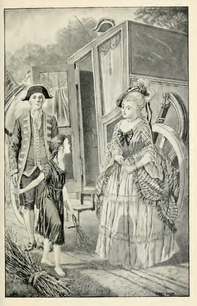
Little Jeanne de Valois