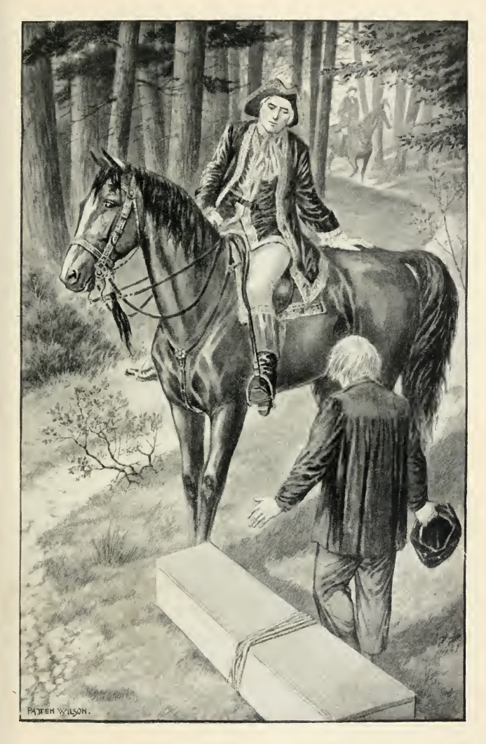
"For my father, sire!"