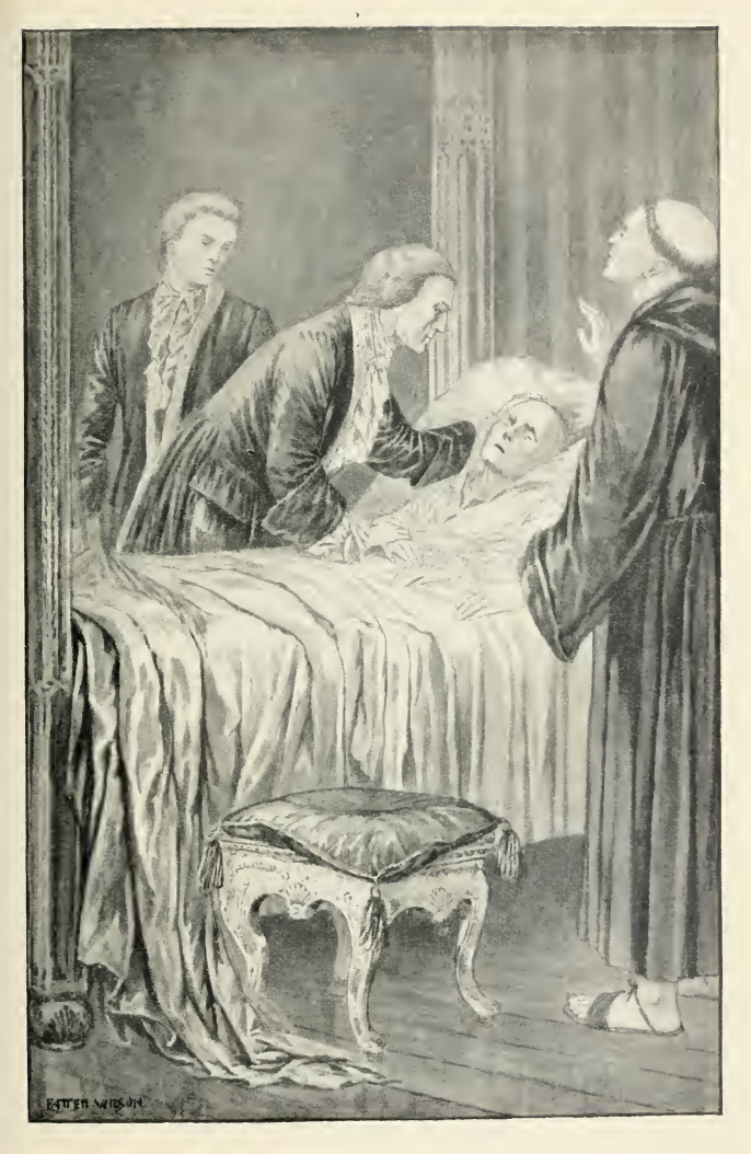
The death of Louis XV